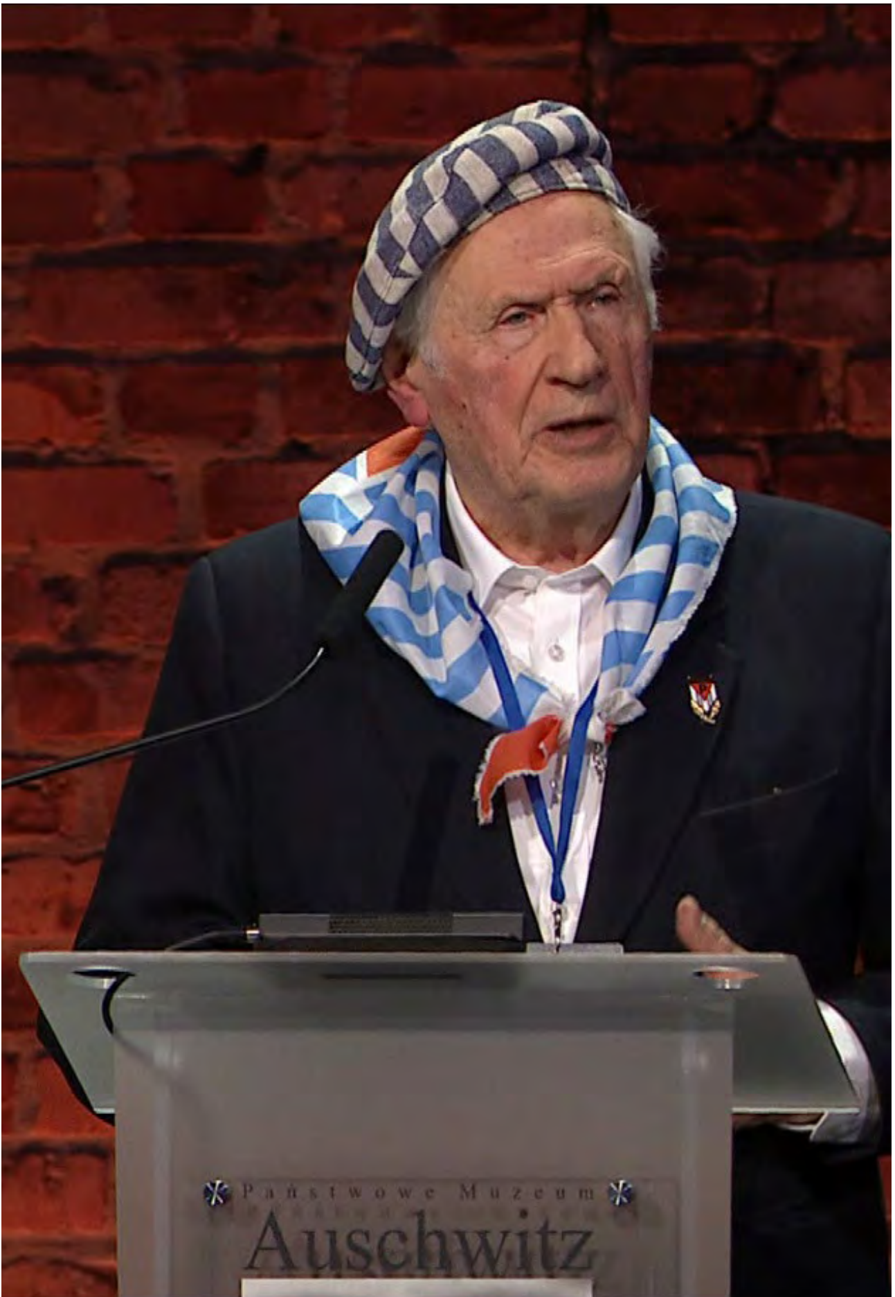
75th Anniversary of the Liberation of Auschwitz-Birkenau concentration camp