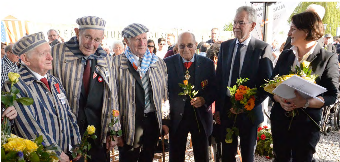
Liberation Ceremony in Gusen in May 2017

Thanks to the efforts of former prisoners, the remains of the crematorium were saved, and a small memorial site was opened in Gusen in 1965. It was not until 1997 that it received the status of an official memorial site of the Republic of Austria and was thus placed under legal protection.