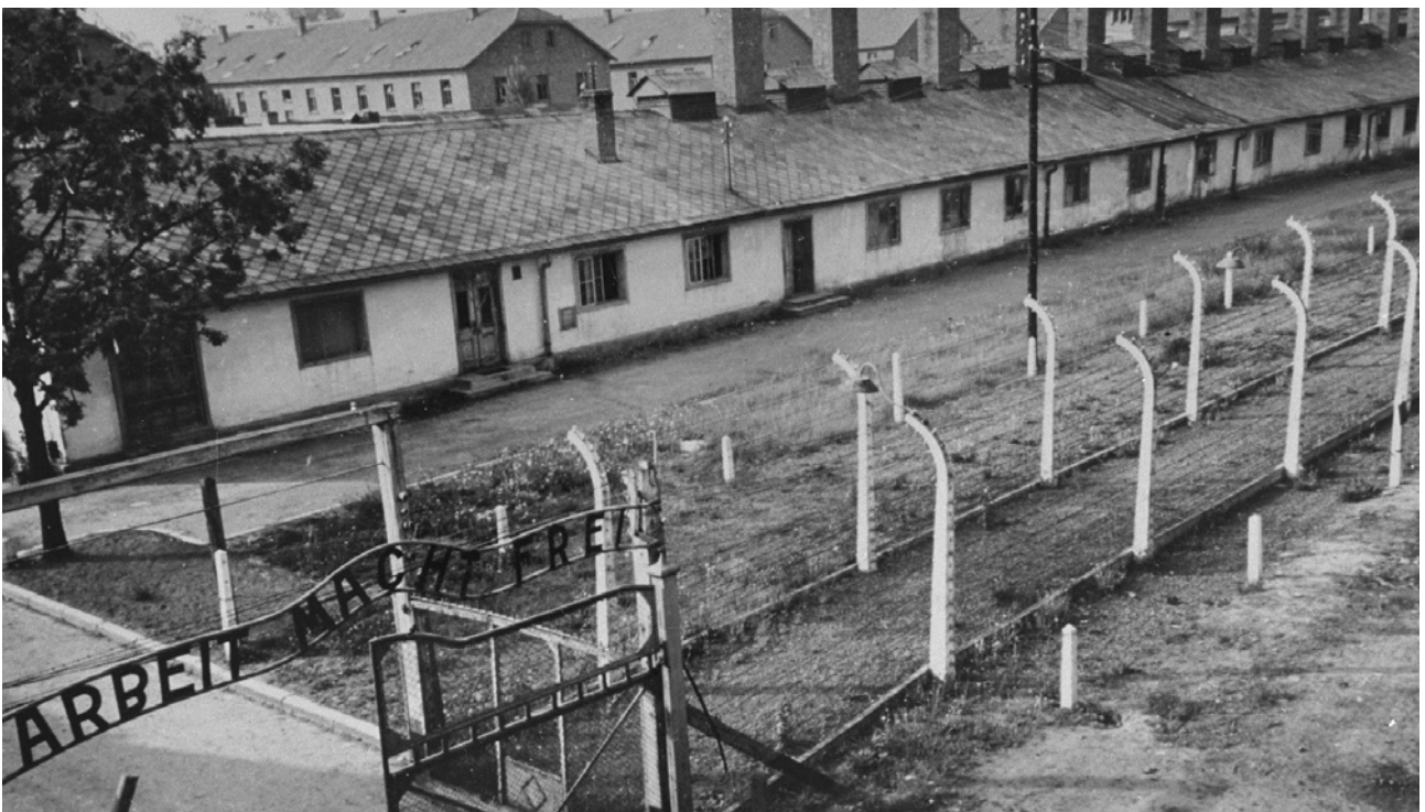
View of the gate of the Auschwitz concentration camp

Of at least 1.3 million people deported to the Auschwitz camp complex, around 1.1 million were murdered. Out of the over 5.6 million Holocaust victims, racial persecution led to the murder of approximately one million Jews in Auschwitz-Birkenau. There were also around 160,000 non-Jewish victims, including Sinti, Roma, and Poles who were also racially motivated, as well as male homosexuals because of their sexual behaviour. Around 900,000 of the deportees were murdered in the gas chambers immediately after their arrival. A further 200,000 people died as a result of illness, malnutrition, abuse, and medical experiments, or were later selected as unfit for further forced labour and murdered. The countries of origin of most of those murdered were Belgium, Germany, France, Greece, Italy, Yugoslavia, Luxembourg, the Netherlands, Austria, Poland, Romania, the Soviet Union, Czechoslovakia, and Hungary.