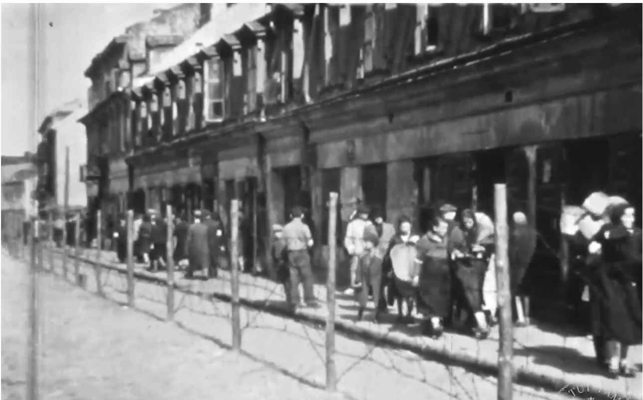
The Warsaw Ghetto

A three-metre-high, 18-kilometre-long wall was erected around the ghetto. Many residents of the ghetto lost their livelihoods and had to perform forced labour in ghetto-owned factories and private businesses. Due to the lack of supplies, the residents were forced to sell their private assets for food. Later, the destitute people tried to smuggle goods over the wall. For many, this was the only way to survive. Daily life in the ghetto was extremely cramped, characterised by surveillance, terror, hunger, and epidemics. The living conditions were catastrophic. Between November 1940 and July 1942, it is estimated that over 80,000 people died as a result of the unbearable living conditions.