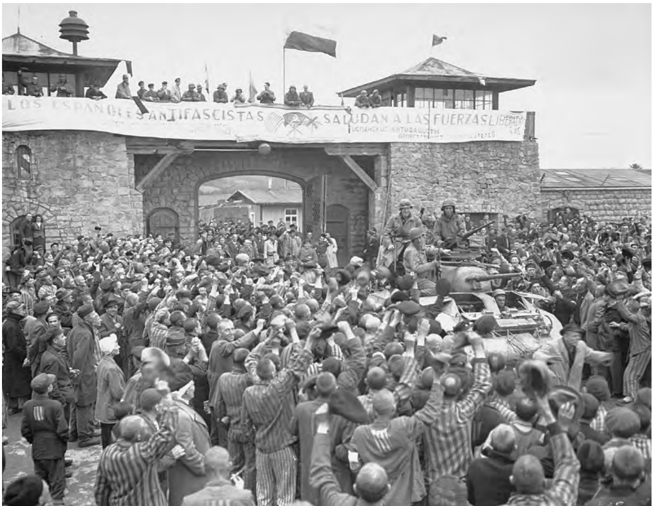
Recreated scene of the first entry of American soldiers in Mauthausen, probably 7 May 1945; Text: Mauthausen Memorial

As early as late 1943, the SS started to use prisoners to dig tunnels in the surrounding mountainsides. The intention was to provide bomb-proof sites for factories being put out of operation by Allied air raids. At the start of 1944, the SS initiated a giant underground construction project in St. Georgen an der Gusen, a few kilometres from the Gusen concentration camp: the tunnel complex with the code number 'B8' and the codename 'Bergkristall'. The purpose of this project was to safeguard the production of Messerschmitt Me 262 fighter jets from air raids. Up to 6,000 concentration camp prisoners worked on the construction site at any one time. Construction continued around the clock, and, under massive time pressure, the prisoners were subjected to constant abuse. Mass production of aircraft fuselages and parts went into operation as early as autumn 1944. By the end of the war, around eight kilometres of tunnel covering an area of around 50,000 square metres had been built.